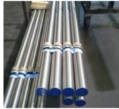
Polishing - Tubes, Bars, Parts