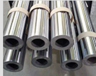
Processing of Heavy Wall, Long Length, Alloy Tubing - Hydraulic Cylinders Used in the Pulp and Paper Industry