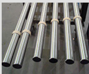
Processing of Type 410 HT Stainless Steel Round Bar for the Power Generation Industry