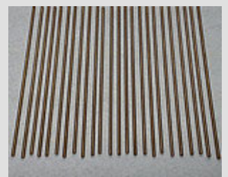
Cutting-to-Length & Grinding of Brass Rods used in Research & Development

Centerless Grinding Service 1929 Sand Court Tucker, GA 30084-6632