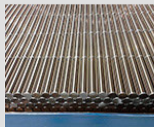
Thru-Feed Grinding of Carbon Steel Oil Pump Shafts for the Heavy Equipment Manufacturer Industry