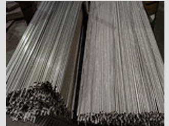
Grinding of Carbon Steel Bars for the Automotive Industry